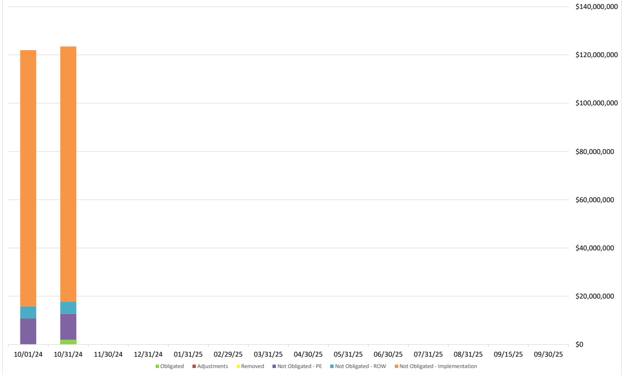
FY 2025 Funding Obligations

If a project is realizing delays that will put the federal funding at risk of forfeiture (i.e., not meet a September 30 deadline), the project sponsor will have the opportunity to request a "one-time extension" of their project schedule. The request for an extension is only available for projects with construction funds programmed in the current fiscal year and is due by June 1, 2025. One-time extensions of up to three (3) months may be granted by East-West Gateway staff and one-time extensions greater than three (3) months, but not more than nine (9) months, will go to the Board of Directors for their consideration and approval. If the project still cannot obligate funds after the one-time extension or the sponsor decides not to proceed, funding will be removed from the TIP, and the federal funds associated with those projects will be returned to the regional funding pool for redistribution without further action by the board.