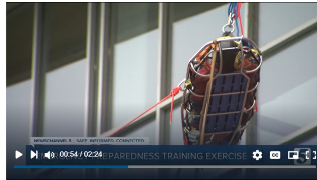
Military partnered with multiple city and state agencies for a large emergency preparedness training exercise.