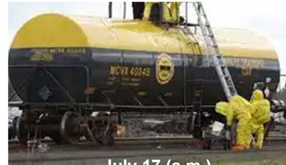
July 17 (a.m.)