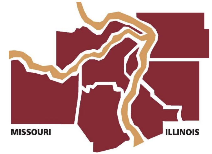
The East-West Gateway area

Appendix A defines 23 CFR 450.334. Appendix B details Advance Construction projects in Illinois. Appendix C provides a graphic summary of obligations, including a breakdown of funding by agency.